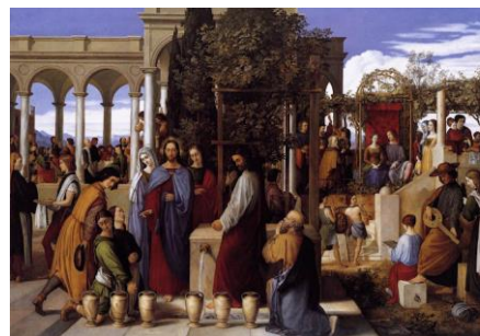
Julius Schnorr von Carolsfeld (1794–1872)